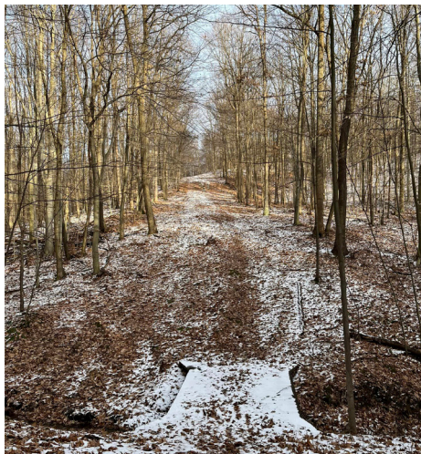
White's Woods in December before the snow.